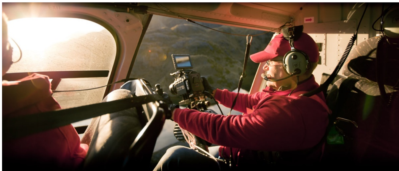
Red 5 standing by