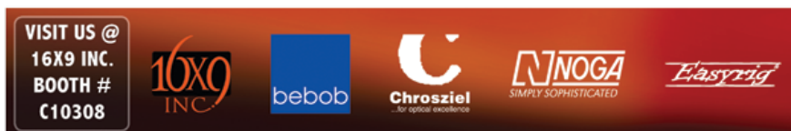
Featured Sponsor of the FKB NAB Map

Welcome to NAB 2011! This should be one Epic show! So first off: head over to the Red Booth (SL6320). Now, while you're waiting in line, take a moment to look over the FinnerKnowsBest.com reduser survival guide for the rest of NAB.